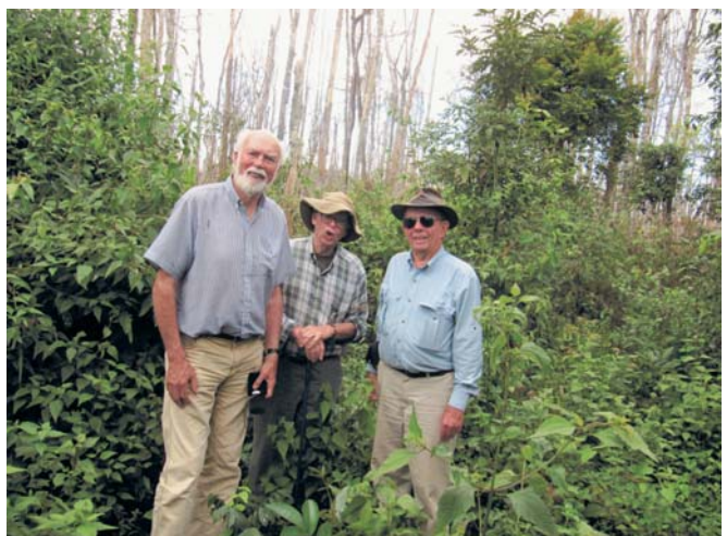
The POE inspecting fallow near Thalang.