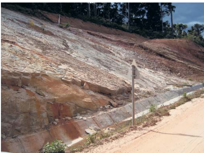
Highway slumping on Nakai/Thalang route.