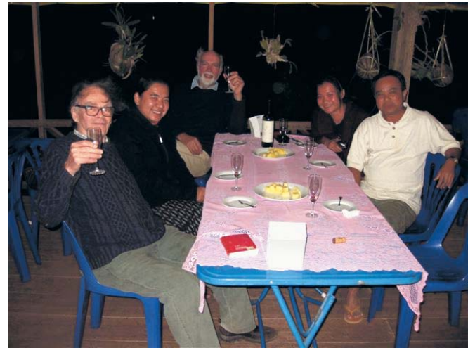
Discussing gender and development issues with the NTPC Gender Officer and the NTPC Social Scientist over a drink.