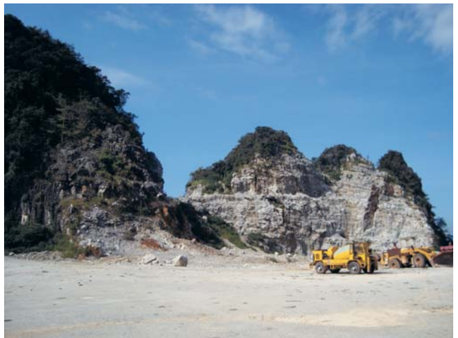
Project quarry site being prepared for sale.