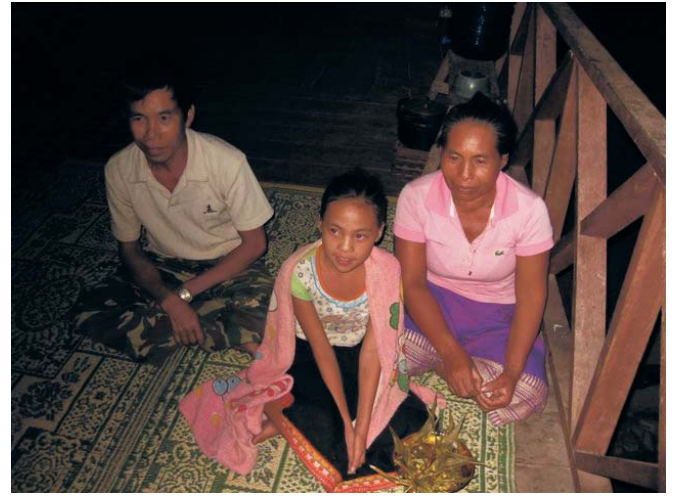
Consultations with Nakai Plateau villagers.