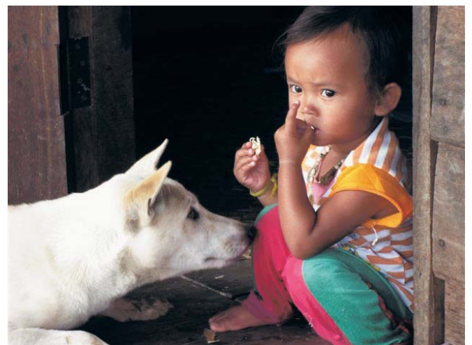
Boy and dog at Phonsavang.