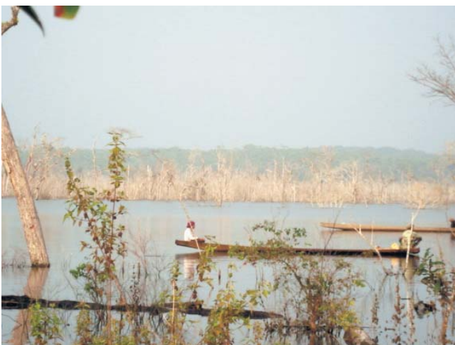
Fishing in the reservoir.