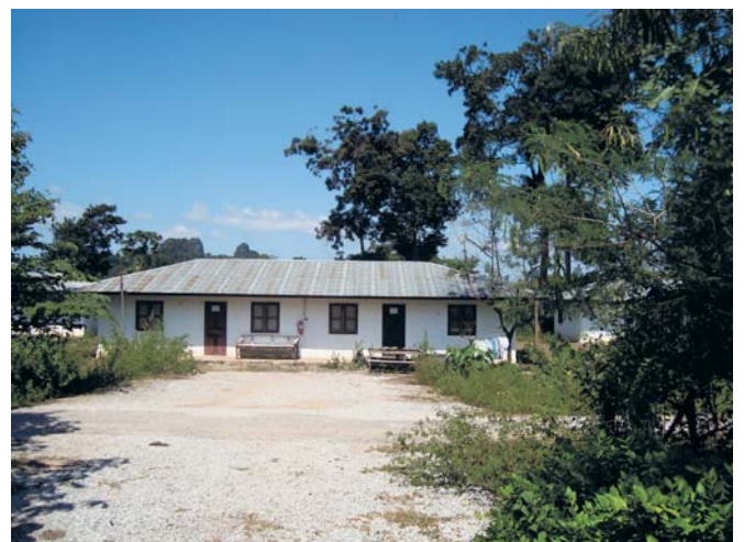
Potential site for conversion to educational facilities, Gnommalath.