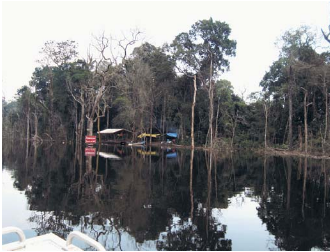
WMPA checkpoint at mouth of Nam On.