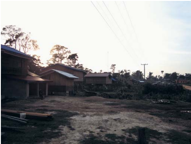
Second generation houses in Ban Done.