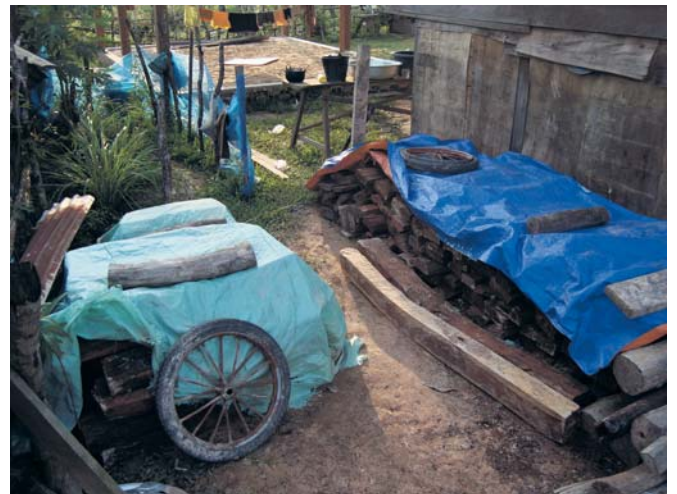
Illegally harvested rosewood piles around houses at Ban Done.