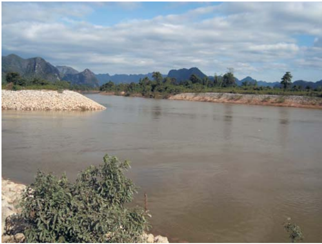
Confluence of project water channel and the Xe Bang Fai.