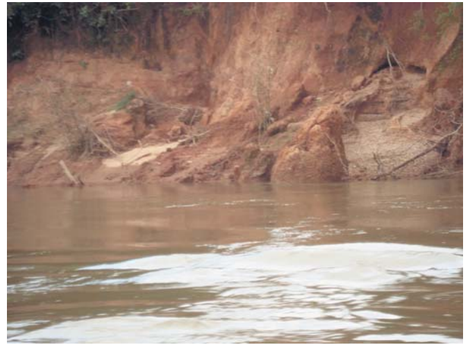
Eroding banks on Xe Bang Fai (but not necessarily project generated).