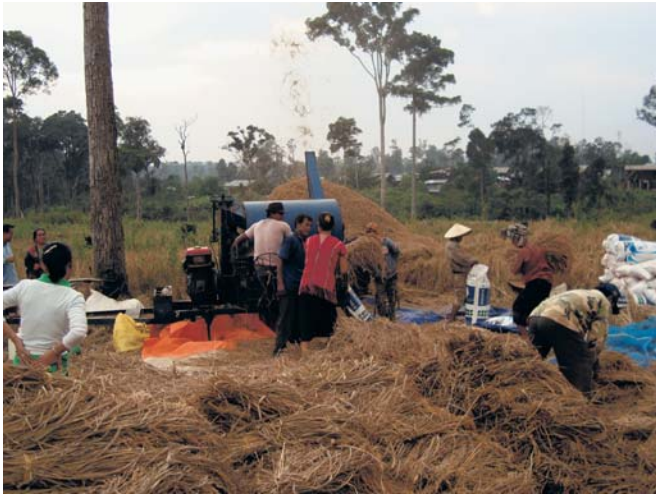
Rice thresher at work in Ban Phonsavang.