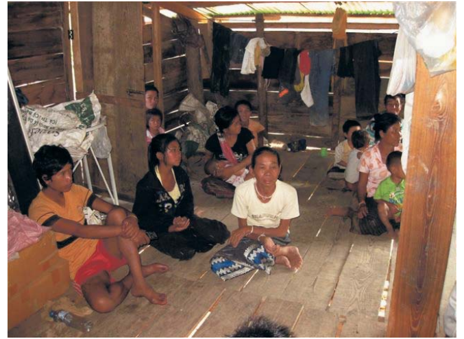
Pakatan villagers in PIZ in discussion with POE.