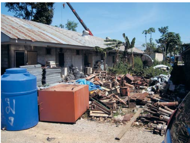
Uncleared construction equipment site, Gnommalath.