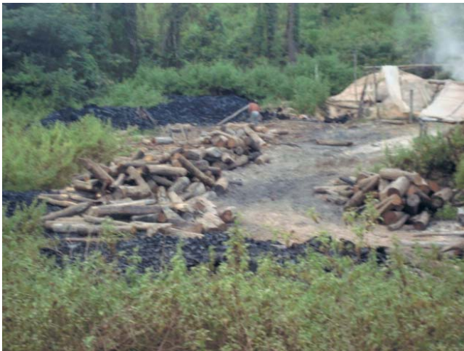
Charcoal plant near Sop Phene using green timber.