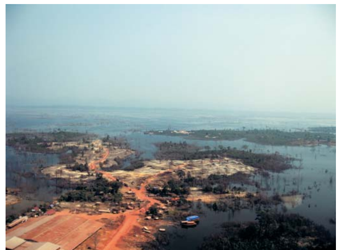
Phonesack extensive sawmill and plant near Oudomsouk on the Nakai Plateau.