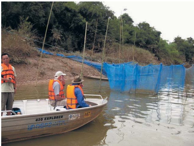
Checking stream outlet on Xe Bang Fai blocked by bank-to-bank nets.