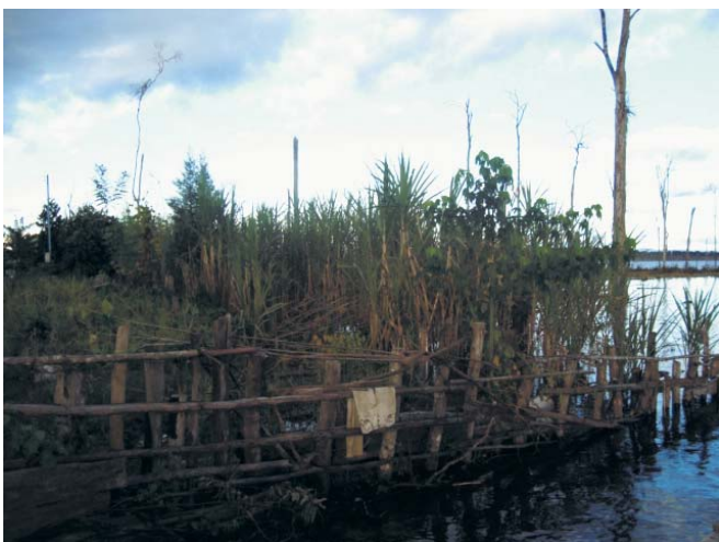
Phonsavang drawdown zone planting.