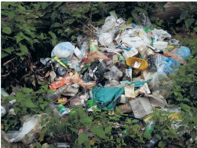
Unplanned rubbish dump near Ban Thalang.