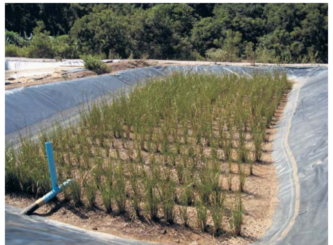
Wetland filter to remove leachates from Gnommalath waste disposal facility.