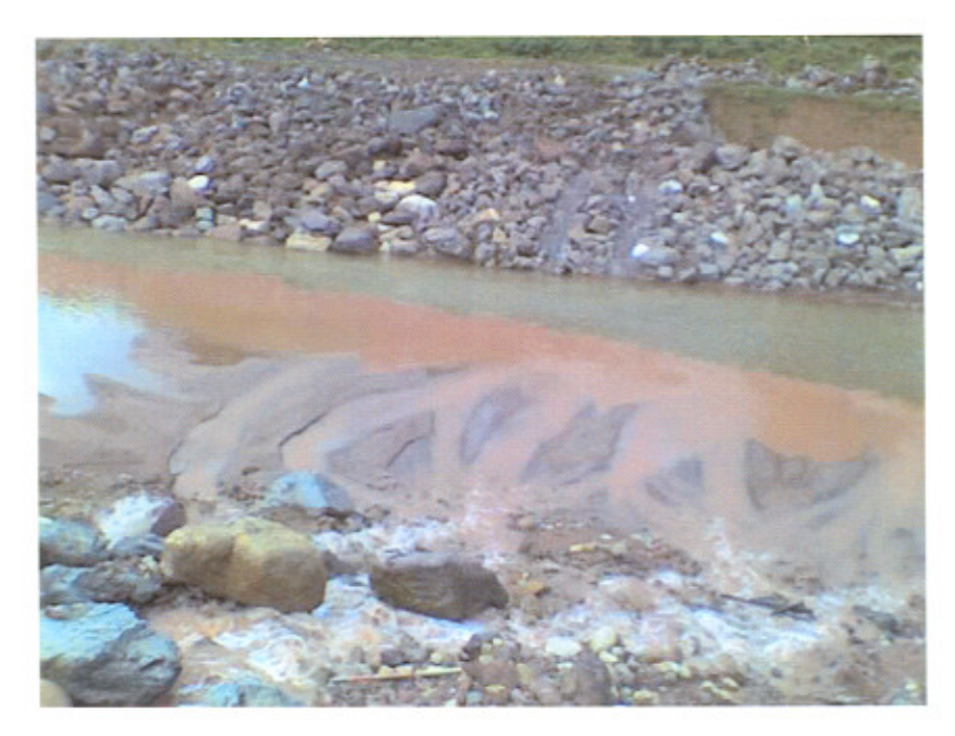
Powerhouse discharge flowing directly into Nam Kathang