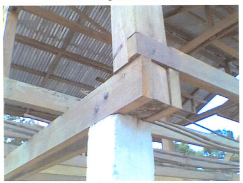
Solid resettlement house frames, new Ban Sop On