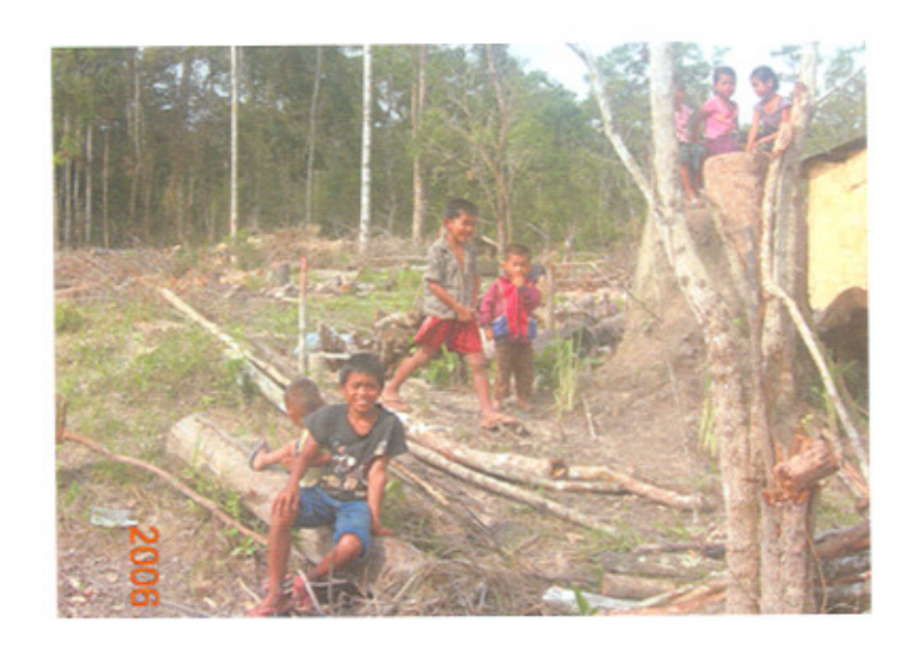
Resettled children adjusting fast to new surroundings, new Ban Sop Hia