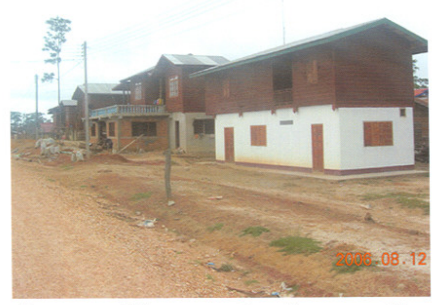
Owners are modifying some resettlement houses---one with basement area enclosed, a second being converted into a tavern as well as a dwelling. Saddle Dam, Nakai