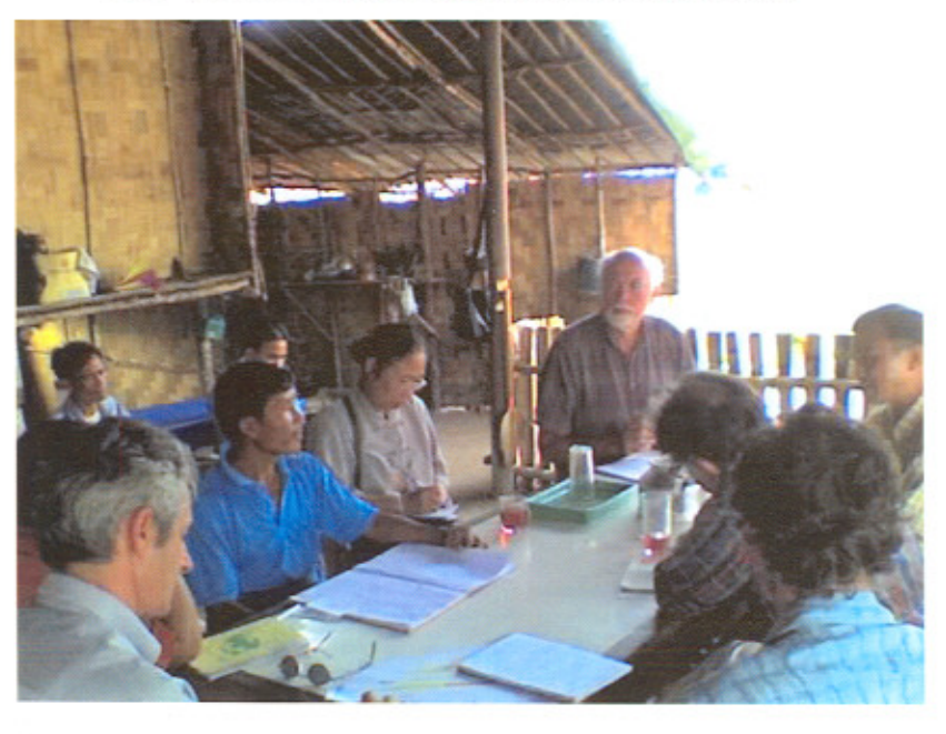
Hearing the views of resettlers