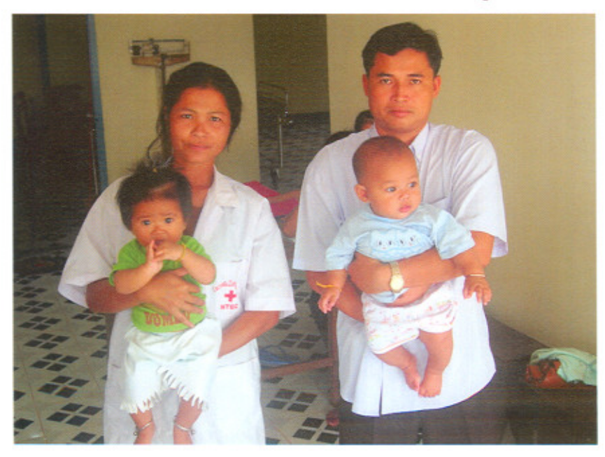
Nakai District Hospital staff with young patients