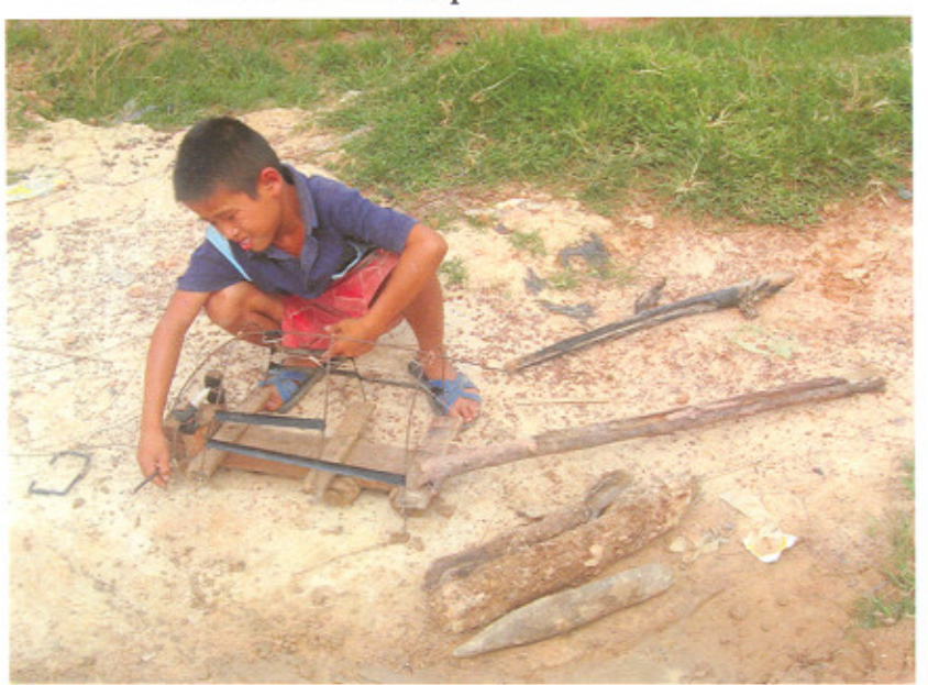
Boy with homemade logging truck. Nakai Town