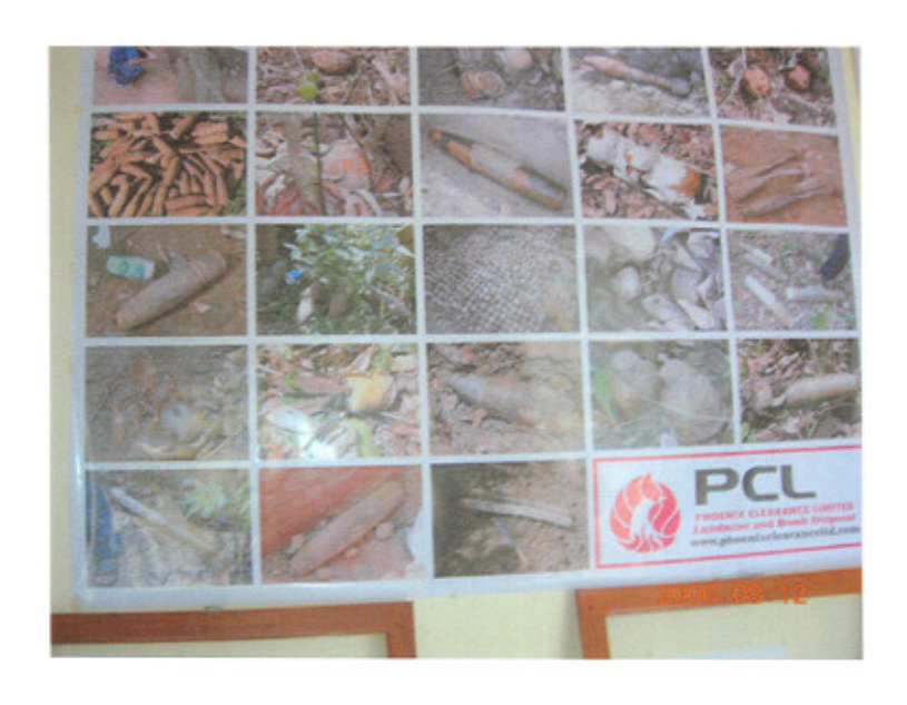
Poster warning villagers of types of unexploded ordnance---a very necessary precaution