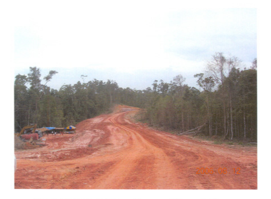
Over-designed road to northern resettlement villages