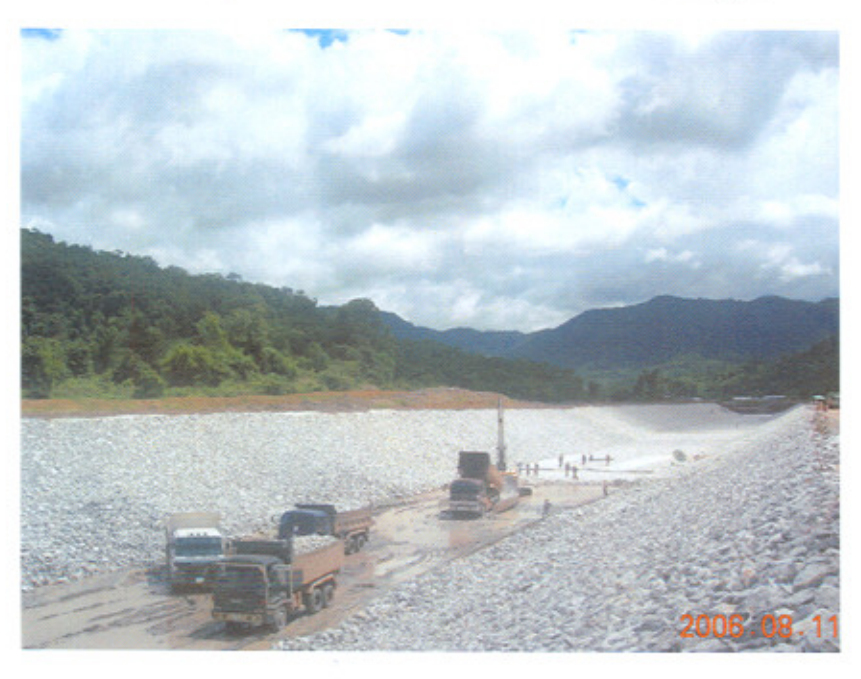
Lining the substantial downstream channel