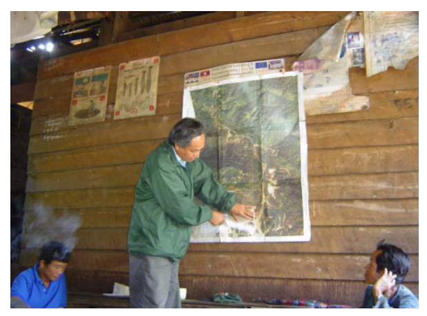
Satellite imagery of the Project Land areas was presented during the initial consultation with village authorities and PAPs.