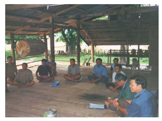
Village authorities were consulted prior to commencing the livelihood surveys, to assist in identifying the project affected families.

Village authorities, particularly the Village Chief and Deputy Village Chief, were also requested to provide ongoing assistance with the process of arranging survey appointments with each of the PAPs (at least one day before conducting the survey). The surveys were conducted by two Livelihood Survey Teams (LSTs), each comprising a team leader, an enumerator and at least one representative from the district government. The government staff assisted in translation from Lao to Makong language during the surveys where required, e.g. for Ban Lao Na Ngam. They also assisted families to identify their land and assets on the satellite imagery, based on their existing knowledge of the local area.