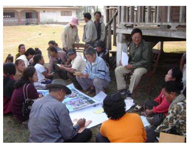
Group Discussions - Oudomsouk Consultations