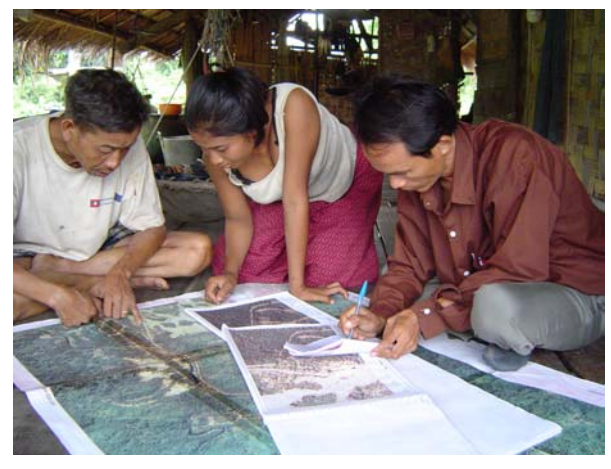
Livelihood survey teams assisted the families to identify their land and assets using satellite imagery of the Project Land areas.