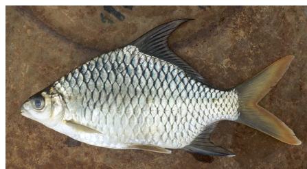
Fig. 4. Scaphognathops theunensis , adult, 160 mm SL, collected in 1996 in Ban Thalang. Fig. 4. Scaphognathops theunensis , adulte, 160 mm LS, collecté en 1996 à Ban Thalang.

Scaphognathops theunensis (Fig. 4) is endemic to the Nam Theun and Nam Gnouang main rivers. In the Nam Theun its range is totally included in the area impacted by the Nam Theun 2 project. In 2002 a survey was conducted in the Nam Gnouang to check its presence, distribution and habitat preferences (Kottelat, 2002). Since, the known distribution in the Nam Gnouang is totally included in the area impacted by the