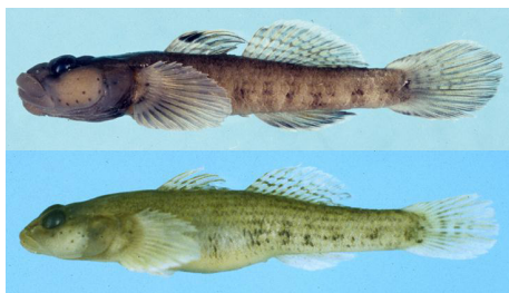
Fig. 18. Rhinogobius lineatus ; male, 36 mm SL (above) and female, 37 mm SL (below).