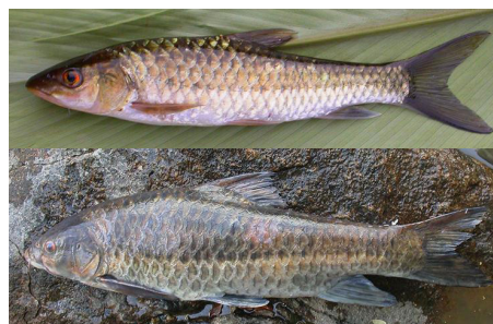
Fig. 6. Tor ater , juvenile, 180 mm SL (above) and adult, 460 mm SL (below).

In 2012, L. striolatus was observed in the Nam Theun both upstream and downstream of the Nakai Reservoir. It is not known in the Nam Phao. In the upstream Nam Theun, four individuals about 50-60 mm SL were observed at the uppermost extremity of a pool, immediately downstream of the rapids/riffles. Villagers reported that they are no longer observing large individuals and that those they now collect are not more than 30 cm long. They consider