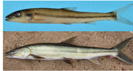
Fig. 5. Luciocyprinus striolatus ; juvenile, 61 mm SL (above) and subadult about 400 mm SL (below).

Villagers in the Nam Theun downstream of the Nakai dam reported that the species was present in the lower