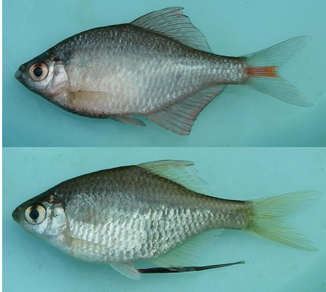
Fig. 9. Rhodeus laoensis ; male, about 40 mm SL (above) and female, about 40 mm SL with black ovipositor tube (below).

Fig. 9. Rhodeus laoensis ; mâle, d'environ 40 mm LS (haut) et femelle, d'environ 40 mm LS avec un tube ovipositeur noir (bas).