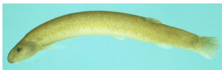
Fig. 11. Pangio aff. fusca , 33 mm SL.