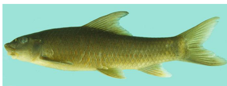
Fig. 8. Bangana elegans : juvenile, 133 mm SL. Fig. 8. Bangana elegans : juvenile, 133 mm LS.

two species of Devario occurring together. Alternatively, this might suggest that the two species have different ecological niches.