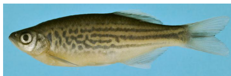
Fig. 15. Devario aff. quangbinhensis , 75 mm SL. Fig. 15. Devario aff. quangbinhensis , 75 mm LS.

attempts to find them outside the NTPC area failed. As the species seem to be impacted by resettlement activities, further studies are needed to determine their endemism. They should include the search for possible additional populations outside the Nakai Plateau.