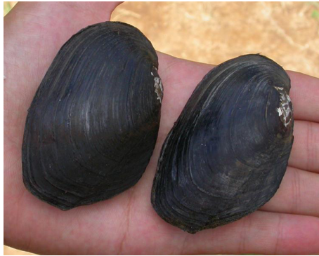
Fig. 10. Pseudodon vondembuschianus , the only species of mussel observed in Nam Theun drainage, in which Rhodeus laoensis probably deposits its eggs.

Fig. 10. Pseudodon vondembuschianus , la seule espèce de moule observée dans le bassin de la Nam Theun, dans laquelle Rhodeus laoensis dépose probablement ses œufs.