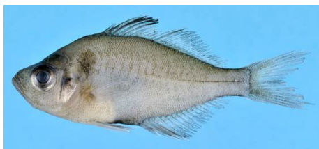
Fig. 16. Parambassis sp. 'slender', 43 mm SL. Fig. 16. Parambassis sp. 'slender', 43 mm LS.

the search for possible additional populations in the Xe Bangfai drainage and possibly in the Xe Banghiang.