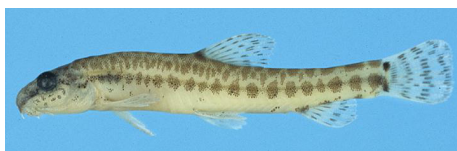
Fig. 14. Microcobitis aff. misgurnoides , 31 mm SL. Fig. 14. Microcobitis aff. misgurnoides , 31 mm LS.