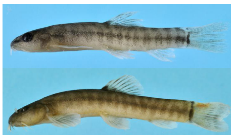
Fig. 13. Schistura sp. 'Nam Kathang'; juvenile, 22 mm SL (above) and adult 59 mm SL (below). Fig. 13. Schistura sp. 'Nam Kathang' ; juvénile, 22 mm LS (haut) et adulte 59 mm LS (bas).

to collect. The largest number of individuals in a single sample (5) was from a small forest stream near (old) Sop On village, in the inundation zone with soft bottom. It is expected to be present in small, permanent tributaries, with a low gradient.