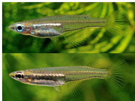
Fig. 2. Oryzias sp. 'swamp', male (above) and female (below); about 15 mm SL (photograph © by Hiromichi Nemoto).

Some species endemic to the Nam Theun, Nam Gnouang and Xe Bangfai drainages occur in habitats or areas where their survival does not seem to be an issue after impoundment (suggested by post-inundation surveys). These species are mainly small benthic fishes. They are Schistura atra , Schistura obeini , Schistura tubularis , Schistura cataracta , Schistura nudidorsum , Nemacheilus arenicolus , Pterocryptis inusitata and Oreoglanis hypsiurus .