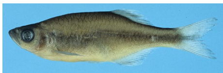
Fig. 7. Devario sp. 'green', 47 mm SL.